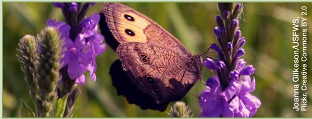
Common Wood Nymph Butterfly on Hoary Vervain