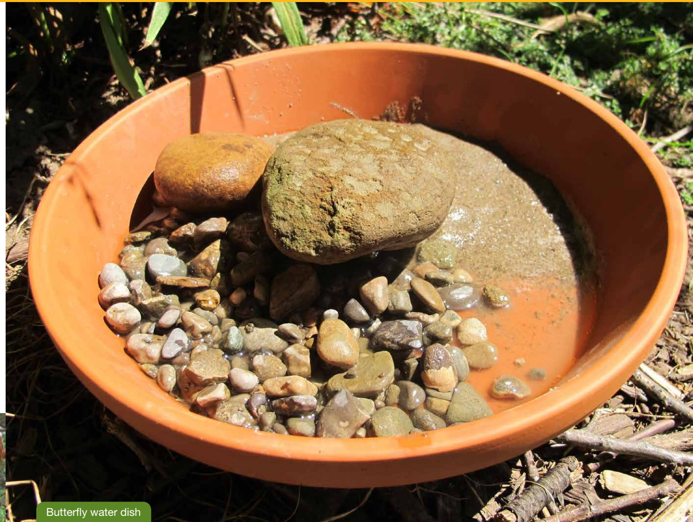
Butterfly water dish