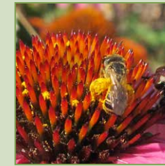
Leafcutter Bee on Coneflower