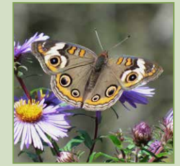
Common Buckeye Butterfly on Aster