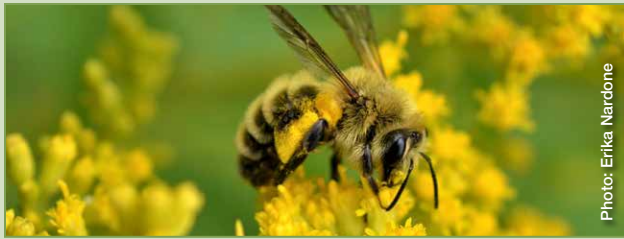
Mining Bee on Goldenrod