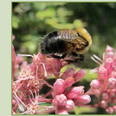
Bumble Bee on Joe Pye Weed

Woodland Prairie Meadow Early Season Mid Season Late Season