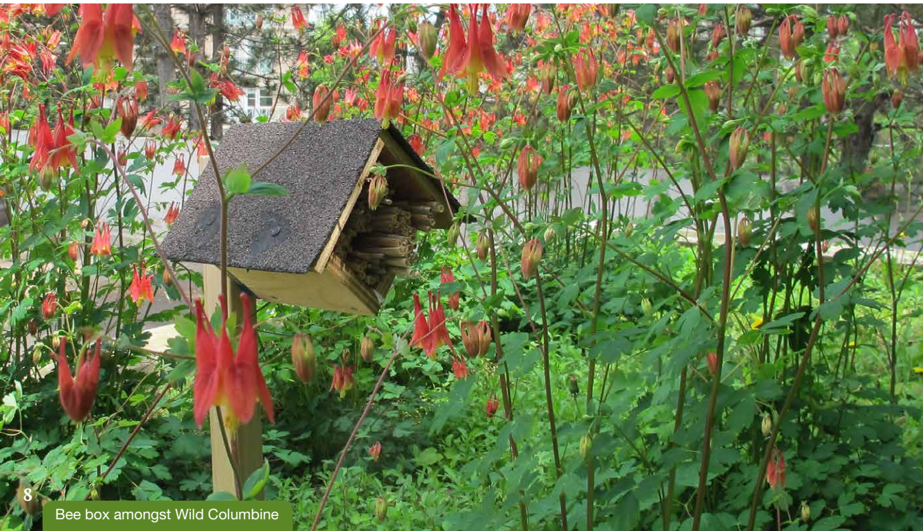
8 Bee box amongst Wild Columbine