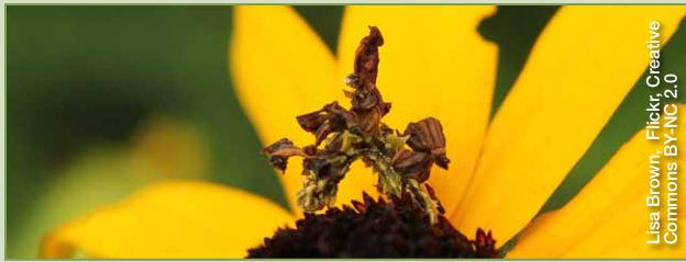
Camouflaged Looper Moth on Black-eyed Susan