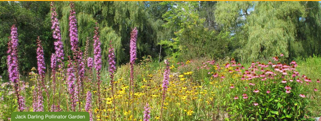
Jack Darling Pollinator Garden