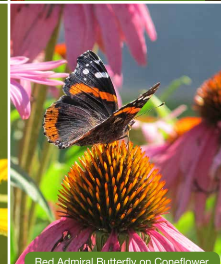
Red Admiral Butterfly on Coneflower