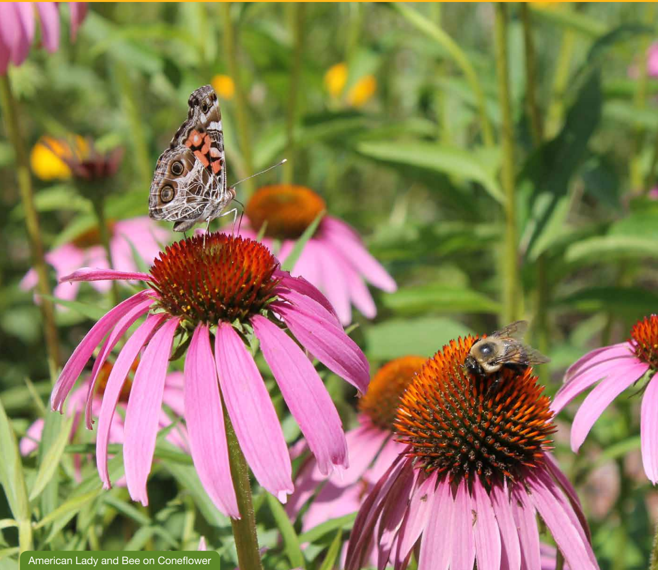
American Lady and Bee on Coneflower