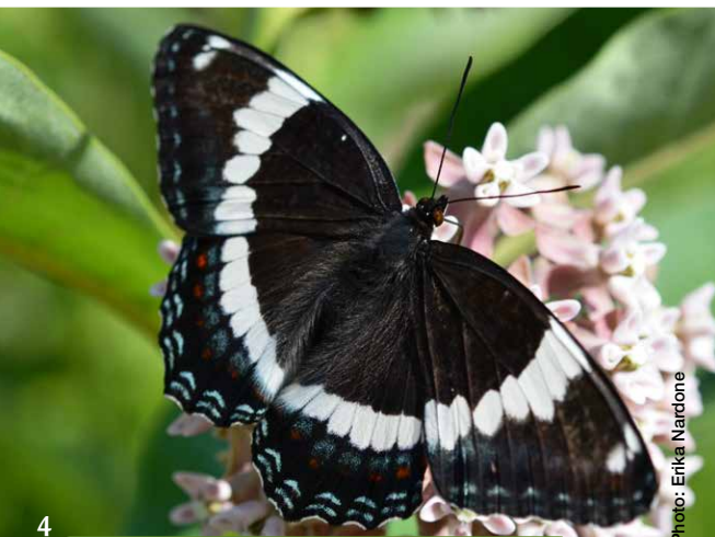
White Admiral Butterfly on Common Milkweed

Some native bees, like many species of Bumble Bees and Sweat Bees, nest in colonies in the ground. Other native bees are known as solitary bees because they nest on their own. Some nest in the ground, like certain Mining Bees, and others, like many Leafcutter Bees, nest in hollow tubes or cavities. Our native bees do not produce the tasty honey we associate with Honey Bees. Nesting bees collect pollen to bring back to the nest and then create a pollen loaf using saliva, which they leave with each egg. Once the egg hatches, the larva feeds on the pollen and goes through several stages of growth, emerging, after one final transformation, as an adult bee.