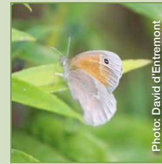
Common Ringlet Butterfly