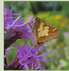
Peck's Skipper Butterfly on Blazing Star