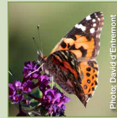
Painted Lady Butterfly