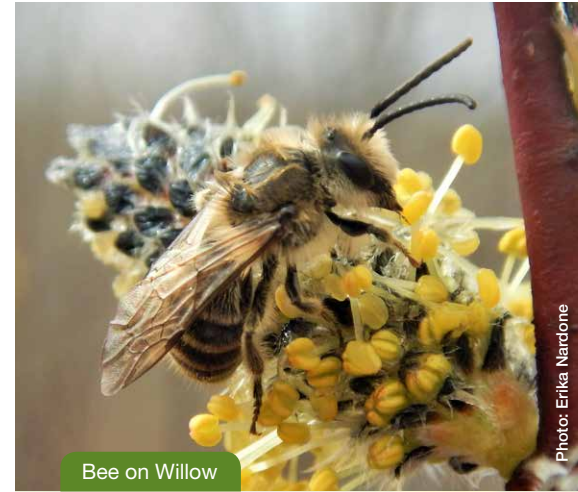
Bee on Willow