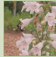
Miner Bee on Beardtongue