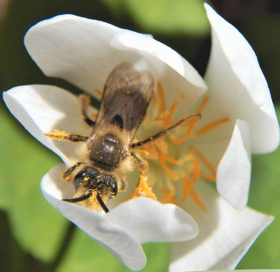
Photo: Mining Bee on Bloodroot.