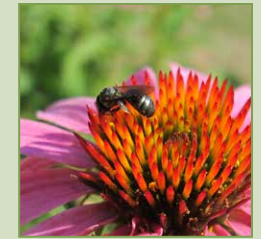
Sweat Bee on Coneflower