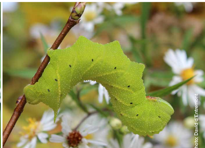
Blinded Sphinx Moth Caterpillar