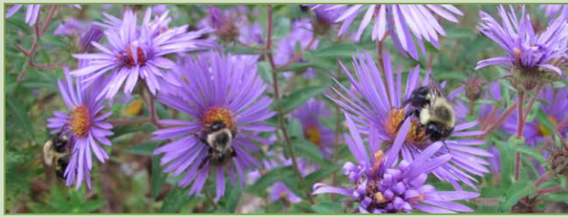
Bumble Bees on Aster