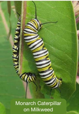
Monarch Caterpillar on Milkweed

* To learn more about the status of Monarchs visit ontario.ca/page/monarch .