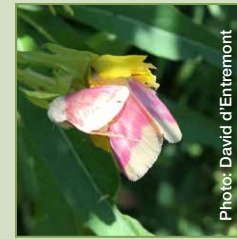
Primrose Moth on Evening Primrose