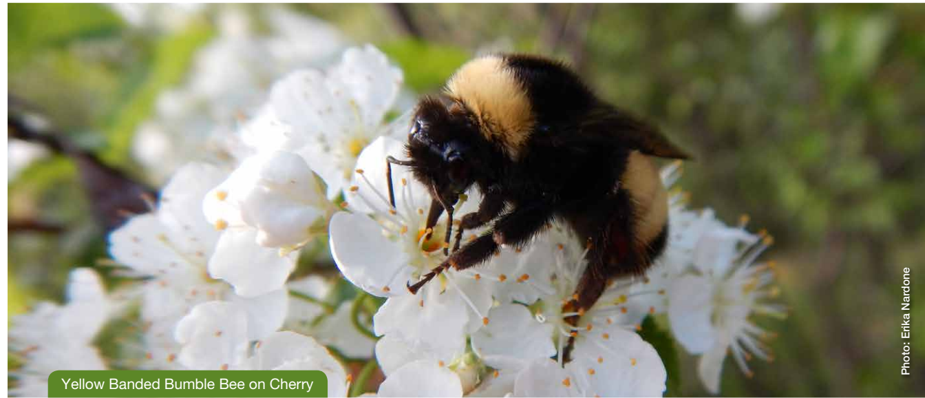
Yellow Banded Bumble Bee on Cherry

* Not for restoration or projects requiring a CVC permit. See page 10.