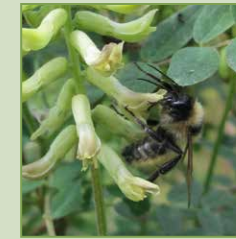
Yellow Bumble Bee on Canada Milk-vetch