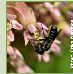
Leafcutter Bee on Common Milkweed