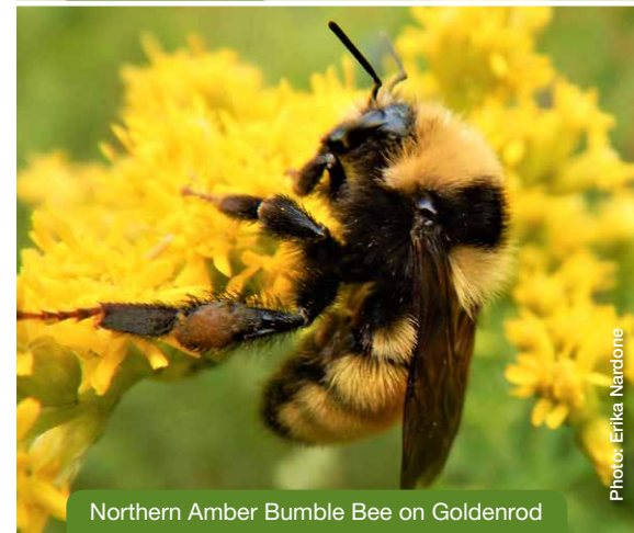
Northern Amber Bumble Bee on Goldenrod