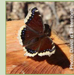
Mourning Cloak Butterfly