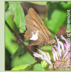
Silver-spotted Skipper Butterfly on Wild Bergamot